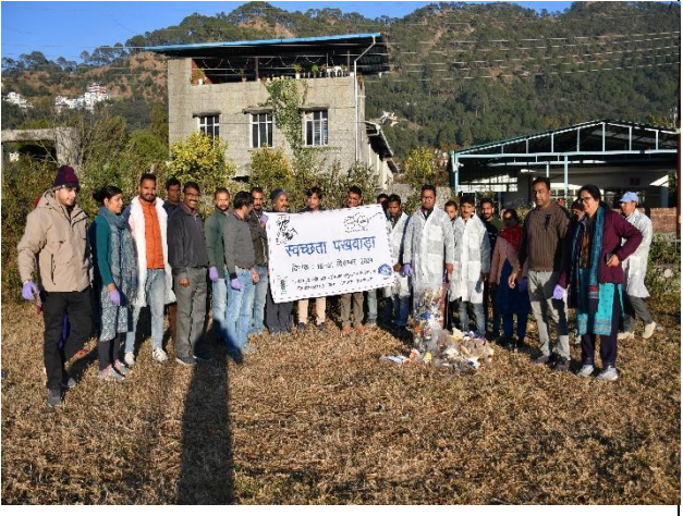
Cleanness & Sanitation drive at 'Public road and Park' near Vikas Bhavan, Bhimtal, Nainital